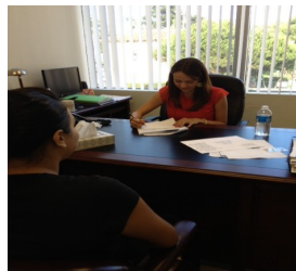
Meeting with a participant and the sponsor event