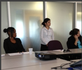
Mock Interviews at Just In Time And A Core Values Poster