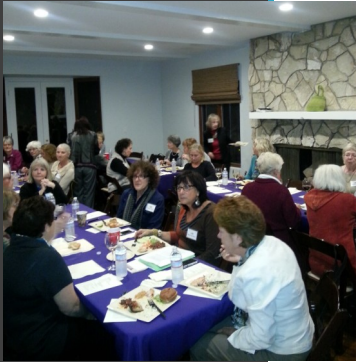
Final Decide Meeting 2013