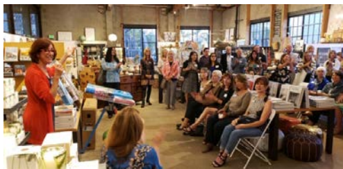
Solana Beach Fund Grant Ceremony celebrating over $100,000 awarded for community programs & services

We are a local organization , serving the community for over three decades.