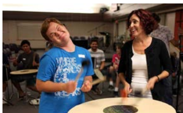
Banding Together Jam Session

Behind each fund at CCF there is a story about people who are making a positive difference. Starting your own donor advised fund is far less expensive than a private family foundation. You receive an immediate tax deduction when you donate cash, stock or other assets. The minimum for a donor advised fund is $5,000.